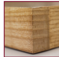
Corner of door showing lipping

Should this door require alteration, cutting or planning, it must be immediately varnished to prevent moisture absorption which may lead to warping or splitting.